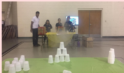
2018 Chain Reaction