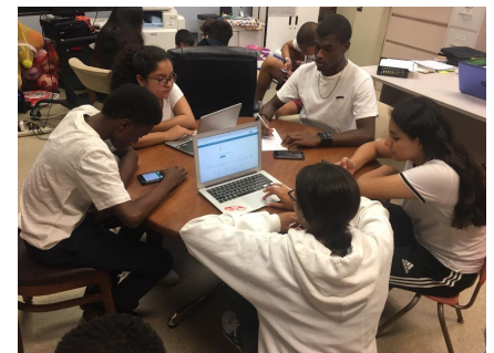
Hands on Banking assessment