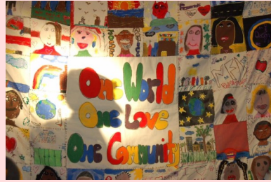
Summer group projects Quilt,(2008) students' silhouettes,(2015) & our diversity (2016)