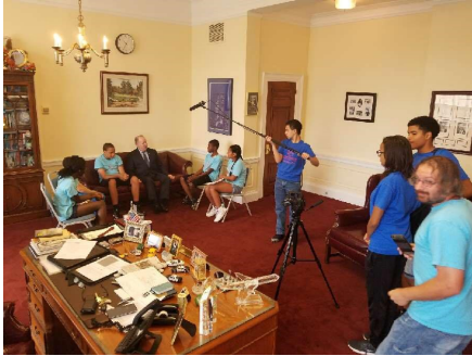
2017 * Interview to Mayor Christian Bollwage Elizabeth City Hall