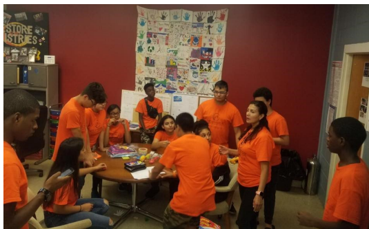
2018 * Junior Staff Future Leaders Training

Each of the pictures has its own caption with the year. You will see our children in action on: our Summer Video Club, interviewing important people, and participating in summer group projects as the community quilt, first aid trainings, banking & financial trainings, Annual Science Fairs partner