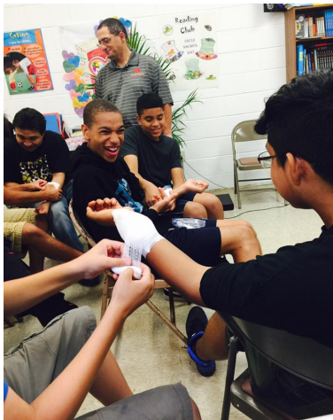
Summer 2015 High School Leaders Students First Aid, CPR & Babysitting Training