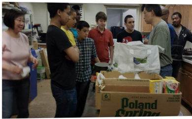
Cooking Class – Theme * Chinese 2014