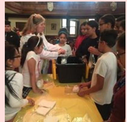
2017 Egg Drop