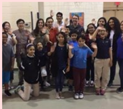
For the past 5 years Phillips 66 New hired employees have been cooperating with Restore in successful annual Science Fairs.