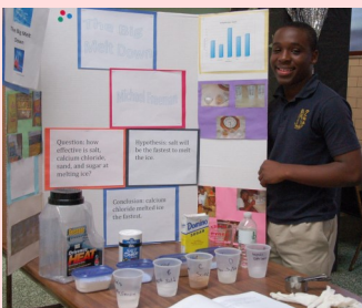
The Big Melt Down * 2013