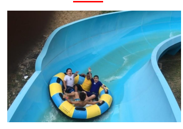
* WE ARE ON THE WEB!! WWW.RESTOREKIDS.ORG FACEBOOK!!!

RESTORE MINISTRIES, INC NON-PROFIT ORGANIZATION