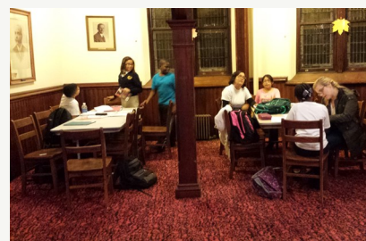
Members during Homework Center