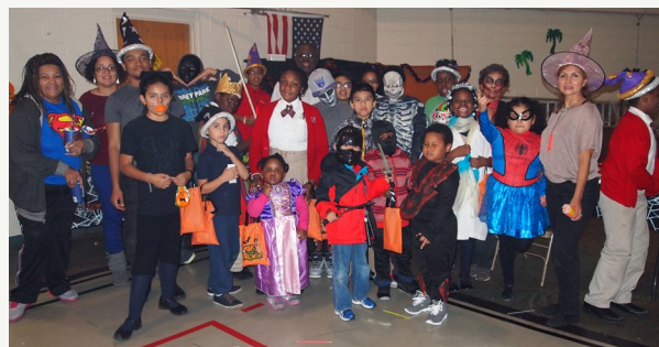
Restore's members, Board members, Volunteers, family, friends and Staff at Hallows eve party