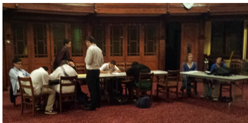
Phillips66 Volunteers and members at Homework Center

Why am I so excited about meeting a number goal? It is not really the numbers that brings joy to me. It is the thought that 40 children and teens and their families will be able to be part of the Restore family. The research I have been reading states that it is not necessarily the programs that keep teens in afterschool programs but the relationships with their peers and the adults who run the programs. Children may at first enter our doors because of their friends, the gym, the food, or to get a ride home on a rainy or wintery