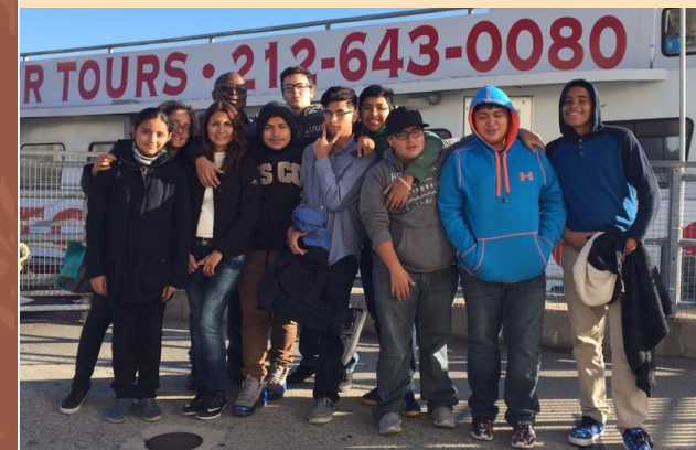
Teen leaders on a field trip to New York City

Helen Keller (1880 – 1968), "Although the world is full of suffering, it is full also of the overcoming of it."