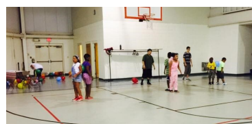
Junior Staff at our summer program

Of course, I believe most teens still look for—and appreciate—the benefits of working in a part-time or summer job but I see worthwhile community service as becoming one of the key resources to teach personal independence and personal and community values.