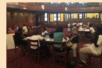
Phillips 66 Volunteers tutoring our members