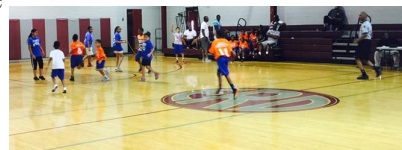
Ministry All-stars – Our basketball team participating in a City league

Thank you for your faithful prayers and financial gifts to Restore. You are making a difference in each child and teenager who enters and becomes a Restore member.