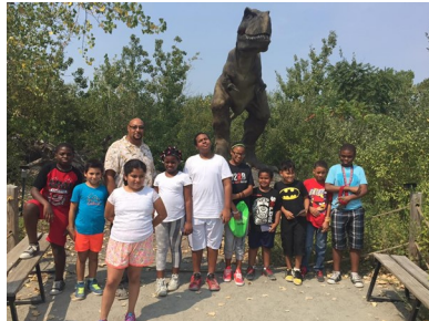
Younger members of Reading Club at Field Station Dinosaur field trip

“Although the world is full of suffering, it is full also of the overcoming of it.”