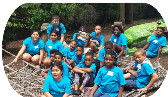
Turtle Back Zoo