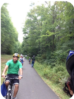
Bike Club at Convent Station