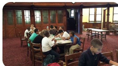
Homework Center with Tutors

Restore staff have the greater responsibility of providing educational support through our Homework Center. Academic achievement is a priority and that is why we provide supplies, space, time, and tutors so that the students can accomplish their task and succeed in school. Some students, especially our teenagers, take it as a punishment that we require an hour to do homework. They complain that one hour eats into their time on the basketball court. But providing the adult volunteer as tutor and mentors helps them be more attentive to their work. Most come to realize