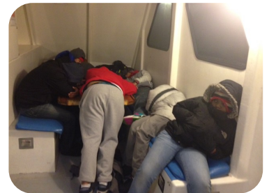
Kids who are sea sick