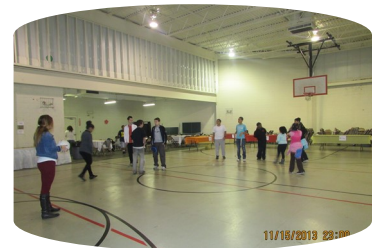
Group activity in the gym