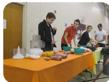
Monthly Saturday cooking class