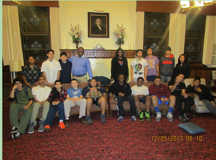
Group picture in the fireplace room

Today about 40% of a teenager's waking hours are