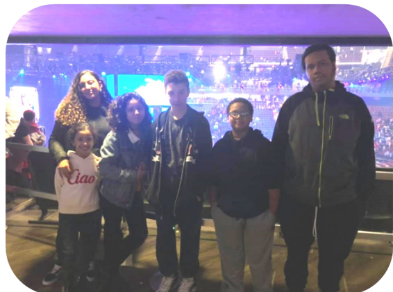
Disney on Ice Field trip