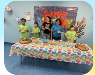
July-August Birthday Celebration