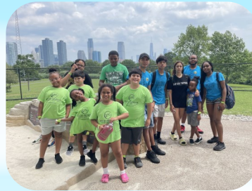
Liberty Science Center