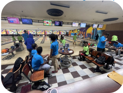
Bowling at Jersey Lanes