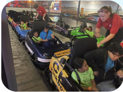
I Play America