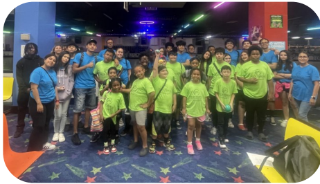
AMC Movie Theater