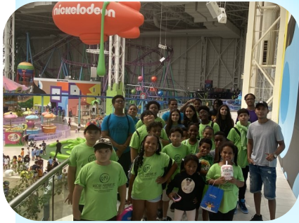
American Dream Mall