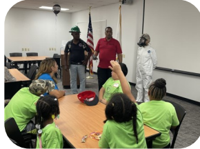
Field Day at Environmental Protection Agency - Edison, N.J.