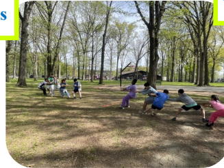
“Bring a Friend Day” Events