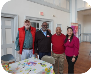
Community Members Visiting Restore