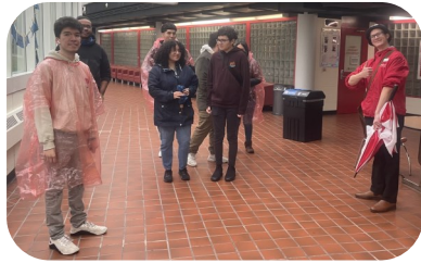
Montclair State University