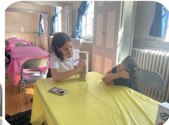
Volunteers & Community Service Group