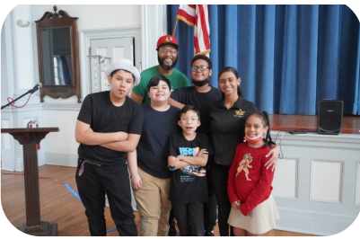
Art Performance - Dance and Fashion Design with Institute of Music for Children