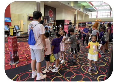
2 Elementary groups (6 to 9 years old)