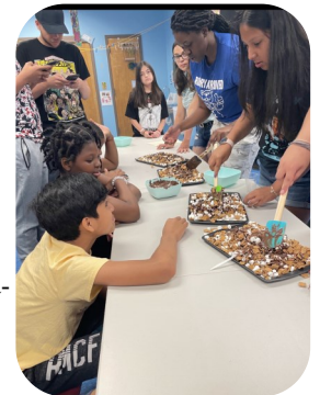
Incredible Days - Virtual Sessions Social Justice “Urban Poverty”