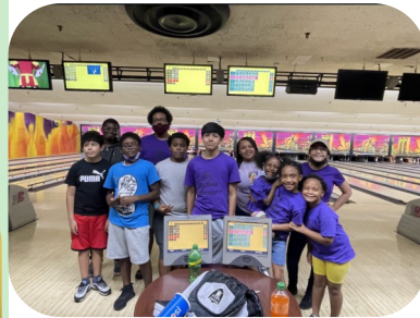
Middle School Team (10 to 13 years old)