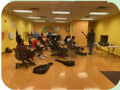
Institute of Music of Children In-Person Sessions Dance, Music and Art.