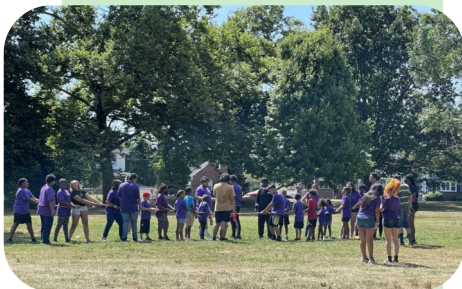
Junior staff High school and college students running outdoors teambuilding activities