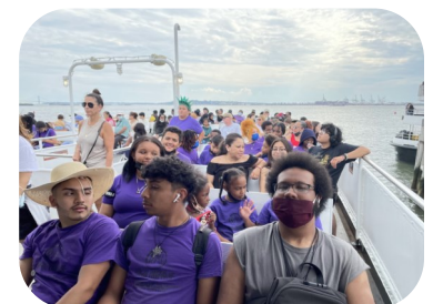
High School Team (14 to 17 years old)